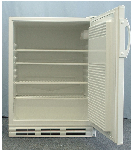
Lab Refrigerator shown