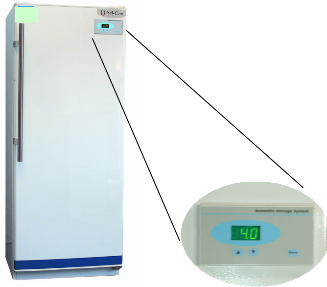
+4C Laboratory Refrigerator