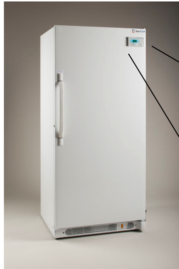
-30° C Laboratory Freezer