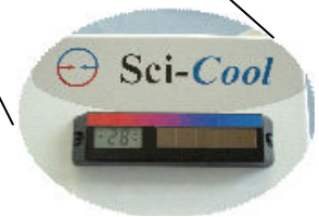
Model SCGP17OW1AF Upright Freezer (shown with optional LCD display)

Sci-Cool's space-saving upright freezer model is ideal for placement beside the work bench, requiring only 5.7 sq. ft. of floor space. This model carries a commercial rating for general laboratory use and comes standard with a manual defrost system that allows you to select the appropriate time for the system to be engaged, unlike auto-defrost models that work on a timer sequence. This product utilizes proven technology used in the household appliance industry, but is manufactured to endure the rigors of commercial laboratory use and carries a warranty for this application. For performance assurance, each unit is completely tested and shipped with its unique pull down performance graph. The exterior is constructed of heavy gauge steel with a baked-on white epoxy coating for long lasting durability and scratch resistance. The interior is white molded ABS with no seams for easy cleaning and decontamination. The interior environment is protected by CFC-free, high-density foamed-in-place urethane insulation. Additional standard features include three fixed refrigerated shelves, a removable wire basket at the floor level for large item storage and five shelves on the door, an interior light, adjustable temperature control, internal floor drain and adjustable leveling legs. Optional built-in independent LCD digital temperature display available.